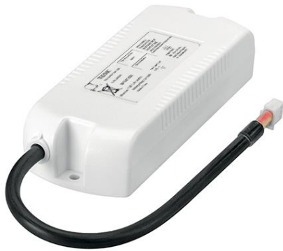
Battery pack 3.0 Ah

Lithium Iron Phosphate cells (LiFePO 4 )