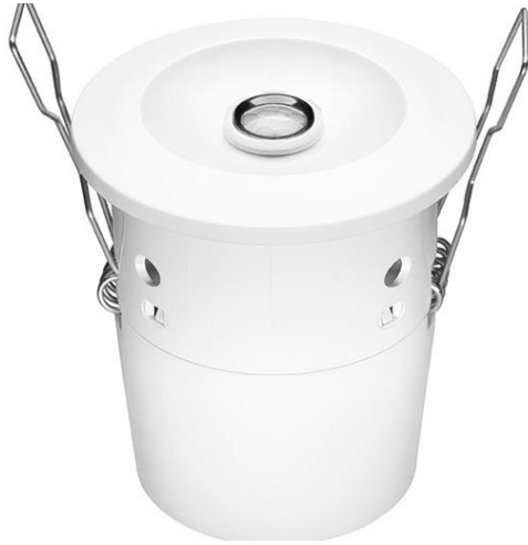
basicDIM ILD G2 SRC 20 5DPI WH