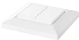
basicDIM Wireless UI EnOcean Double