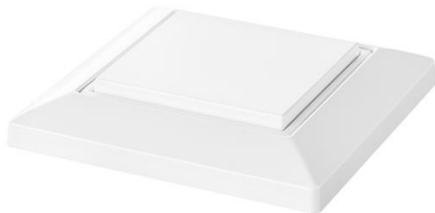
basicDIM Wireless UI EnOcean Single